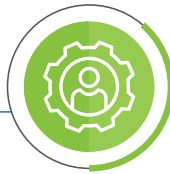
User Controlled Settings